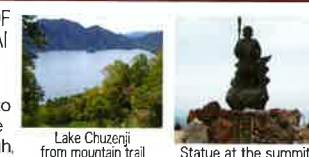
Lake Chuzenji from mountain trail Statue at the summit

This sacred mountain basically open to the public for a certain period of time (May 5th to October 25th). The path is very well-trodden and so steep. It's less than 5km from the shrine to the summit, but you climb over 1200 vertical meters. The level of difficulty is high.