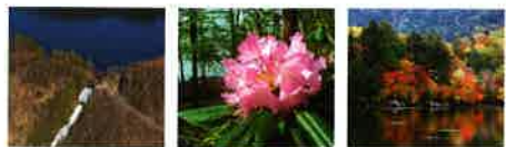
Lake Yunoko & Yutaki Falls Rhododendron Lake Yunoko. Colored Leaves

Short flat course. It might be rather strolling than hiking. There are many species of birds such as Bush Warbler, Great Tit, Woodpecker, Wagtail and Mallard. Also Ducks in winter. In May and June, you will find the beauty of east rhododendron along the southern shore. Lake Yunoko is also known as Mecca of fishing. Lake boat is available.