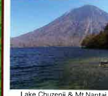
Lake Chuzenji & Mt. Nantai