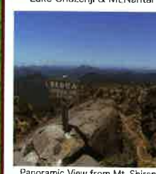
Panoramic View from Mt. Shirane